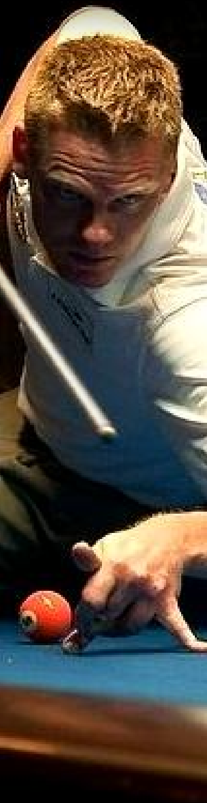
Niels 'The Terminator' Feijen Straight Pool World Champion