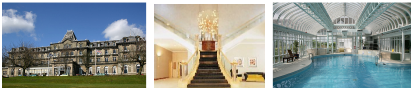
Fabulous new hotel venues for the GB 9 Ball Tour

We are delighted to announce a 2 year agreement with the Barceló Hotel Group who will host GB9 tournaments during the 2010 and 2011 seasons. Barceló operate twenty one 4 star hotels across the UK, each with excellent dining, meeting and leisure facilities. Barceló will be offering preferential room rates, as well as subsidised menus and drinks especially for GB9 members, families and friends. Each hotel will provide exceptional accommodation and playing facilities for GB9 members.